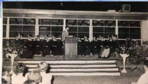
1952 Phoenix Christian Graduation