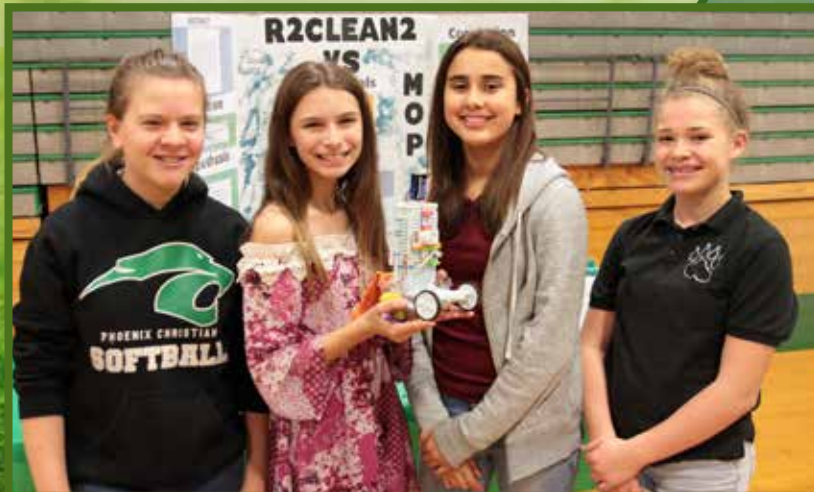
R2Clean wins first place!