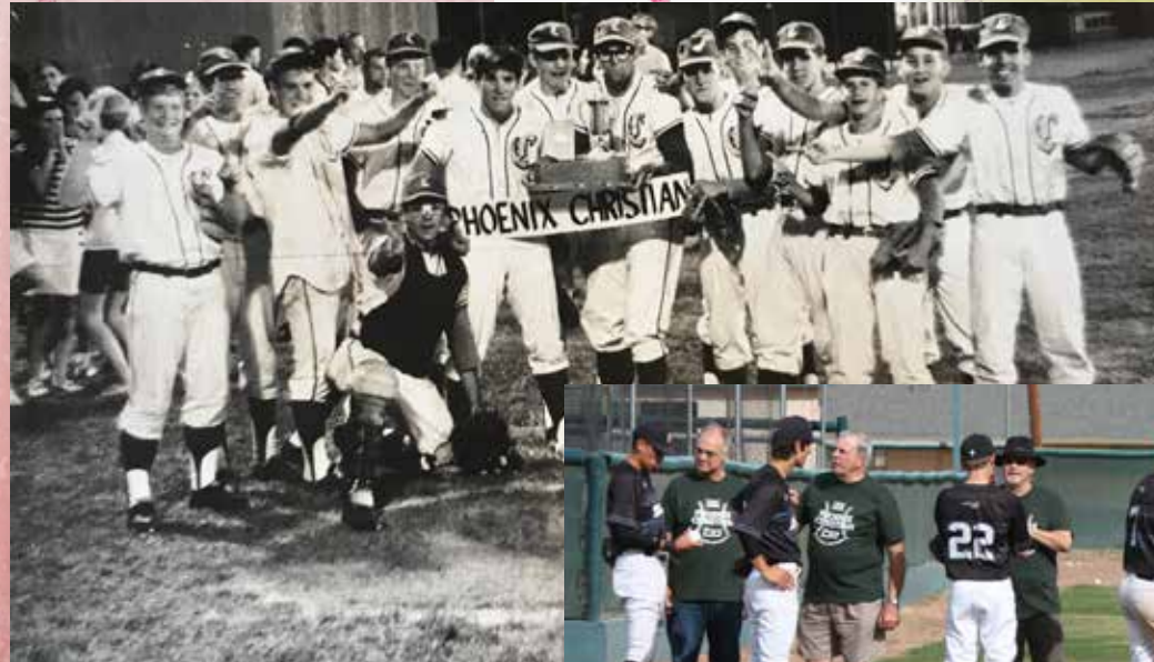
March 16th, we welcomed back several members of the 1968 Baseball AIA State Champions at the Phoenix Christian Baseball game vs Chandler Prep. It was exciting to see so many alumni return home!

We'd love to hear from you! Please send updates or comments to cougarnow@phoenixchristian.org .